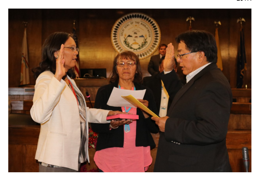
Tina Tsinigine takes the oath of office delivered by Acting Chief Justice Holgate on October 18, 2017, before the Navajo Nation Council. Ms.Tsinigine was confirmed as a probationary judge the day before by the Council.