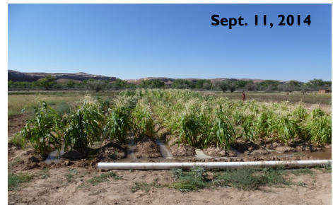
Sept. 11, 2014