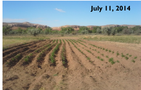
July 11, 2014