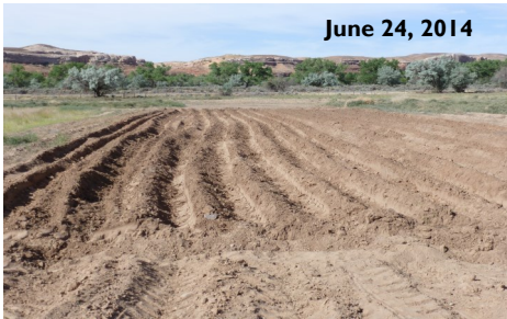
June 24, 2014