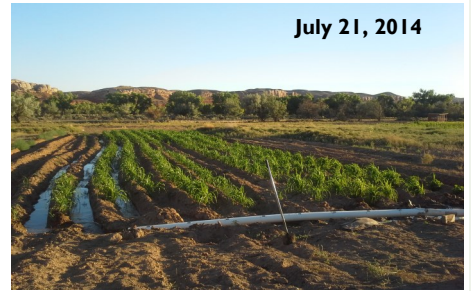
July 21, 2014