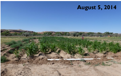
August 5, 2014