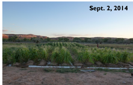
Sept. 2, 2014